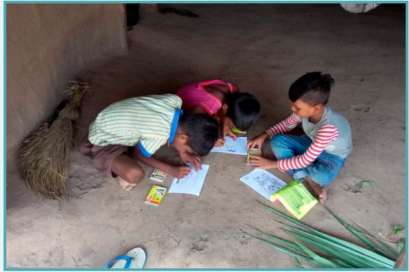
▶ Distribution of drawing books by Child Line during lockdown