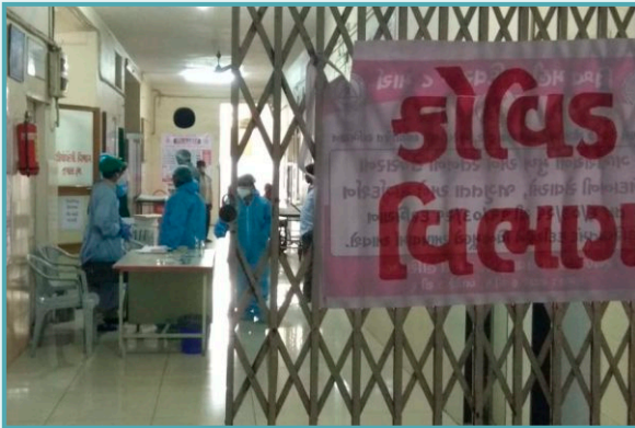
◀ Covid ward in hospital