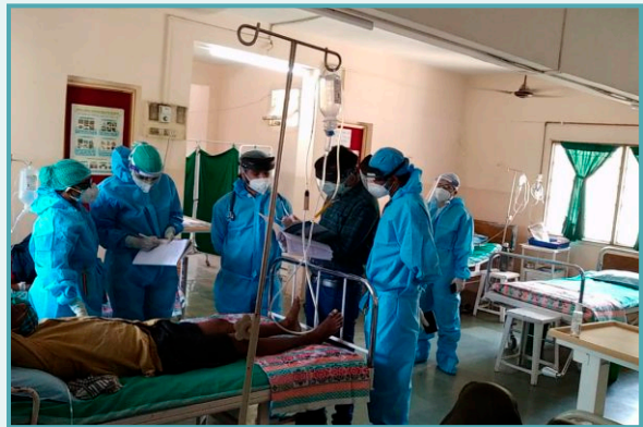
▶ Covid ward in hospital