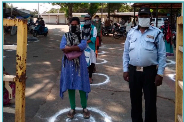
▶ Social distancing and serial wise entry in hospital