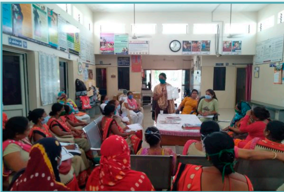
◀ Sangee sanitary napkin demonstration for PHC staff and ASHA workers