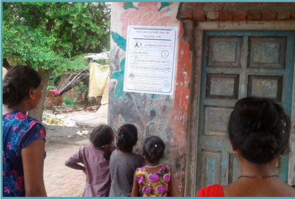
◀ Covid information posters displayed in villages