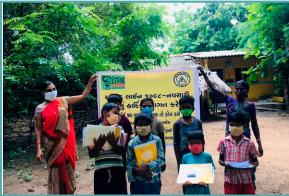
◀ Distribution of drawing books by Childline