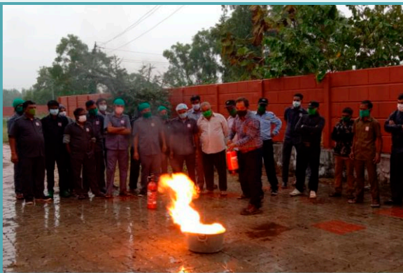
◀ Fire safety mock drill