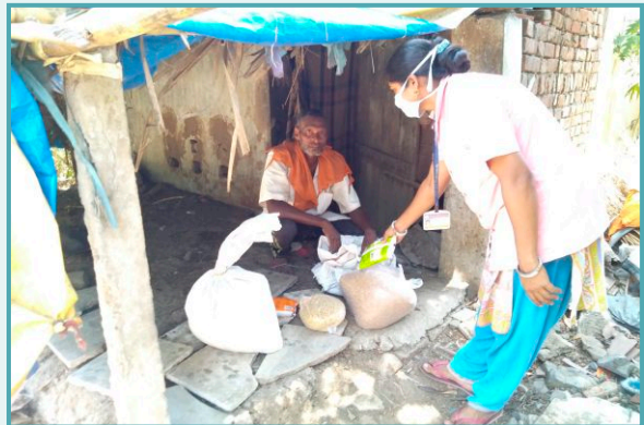
◀ Distribution of masks in villages during Covid pandemic