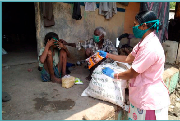
► Distribution of food kits to poor families during lockdown