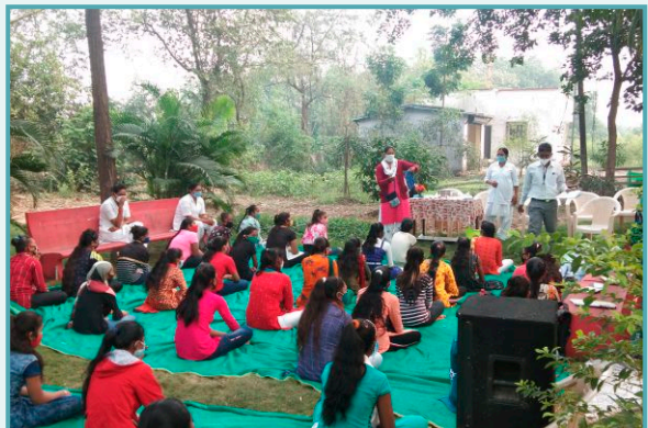
▶ Lecture on Menstrual Hygiene to school students