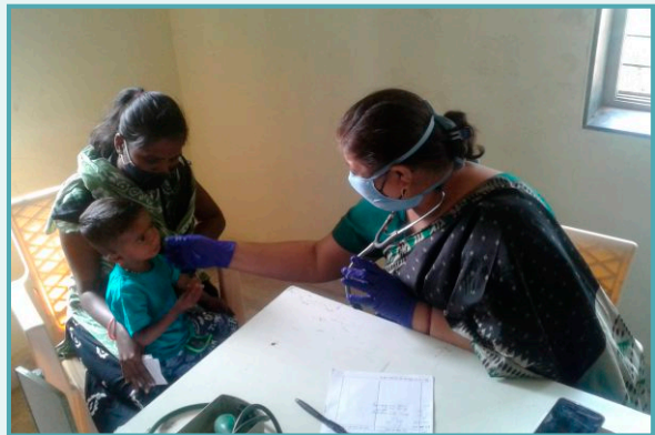
▶ Child checkup at Bhinar Satellite Centre