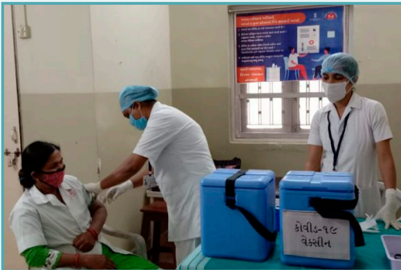
◀ Vaccination against Covid for staff