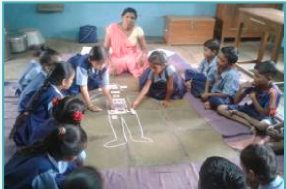
Primary School Health, Hygiene and Nutrition project