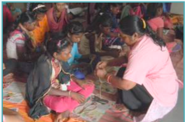
Workshop for adolescent girls