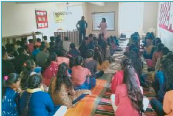
Aptitude tests and Career Counselling for 10th and 12th std. students