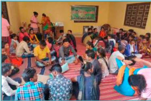
Newly married couple workshop