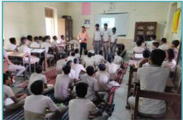
High-school Adolescent workshop