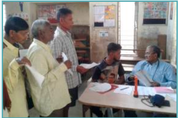
Examining patients in camp