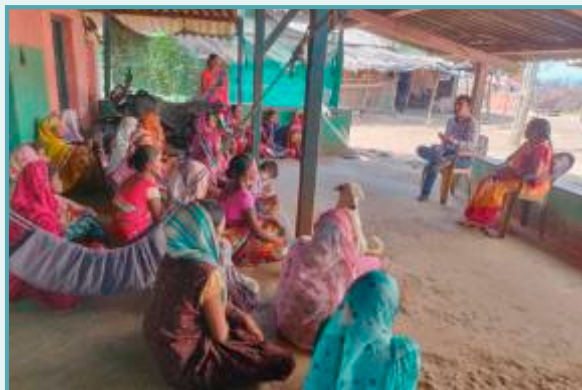
Village Meetings in Dang